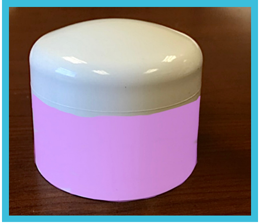
EXAMPLE: when priming PVC fittings, brush the primer on the INSIDE. For the cap, brush until you reach the line.